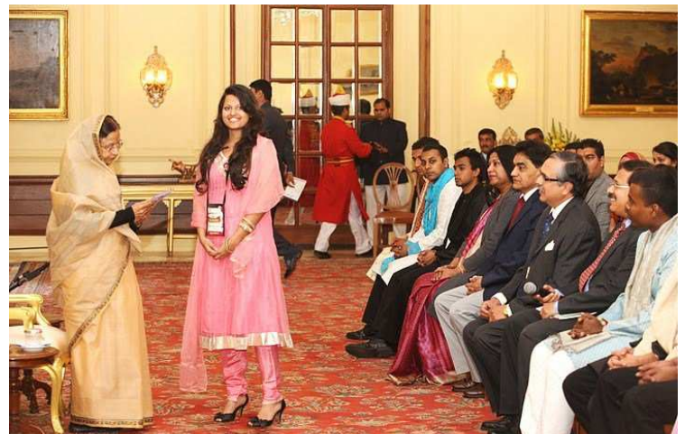
Presenting her gift from Vancouver to Smt. Pratibha Devisingh Patil – President of India.