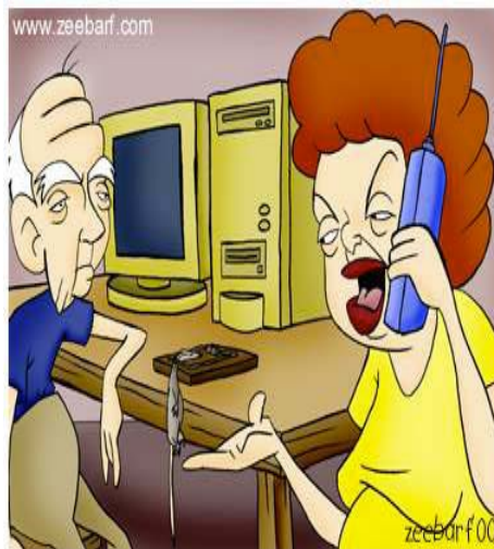
"Okay your father managed to get a mouse. Now how do we use it?"